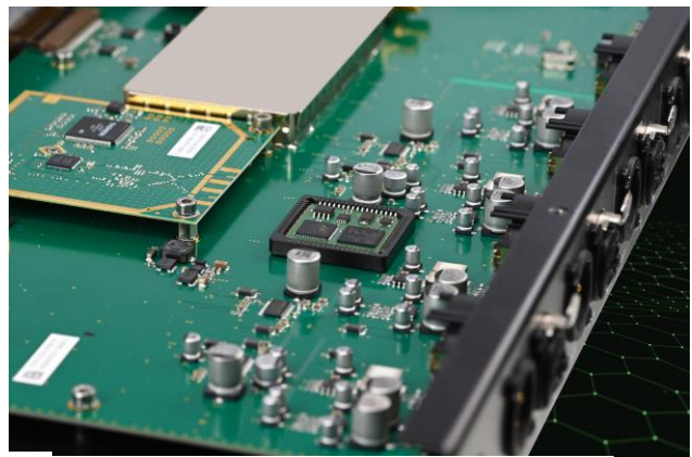
Graphic: 02 neutrik_minea_image